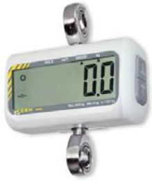
Kern Lifter Scale class III Approved Capacity : 300kg Accuracy / Graduation: 100g