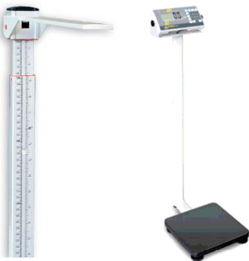
Kern Personal Floor Scales class III Approved + Height Rod Capacity : 200kg Accuracy / Graduation: 100g