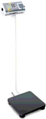
Kern Personal Floor Scales class III Approved Capacity : 200kg Accuracy / Graduation: 100g